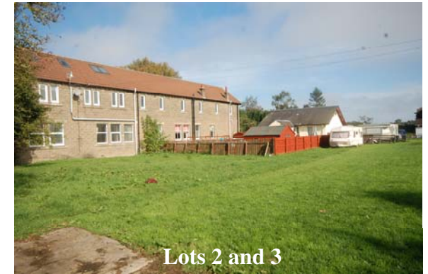
Lots 2 and 3

LOT 1 – Charming extended 5 bedroom semi-detached one and a half storey house situated up a quiet road which services three other houses on the edge of Thornton. The property extends to approximately 142 sq m (157.8 sq m including conservatory). It has been extensively extended both horizontally and vertically into the attic and provides spacious accommodation over two floors. There is an off street parking area with numerous spaces available adjacent to the house.