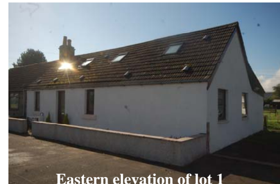
Eastern elevation of lot 1