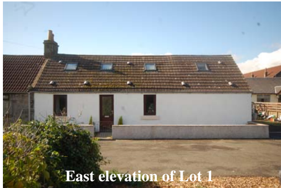
East elevation of Lot 1

Kirkcaldy 4.5m Glenrothes 5.5m Dunfermline - 15.3 Perth - 27.1m Edinburgh - 29.7m