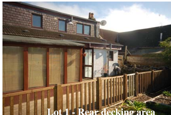
Lot 1 - Rear decking area