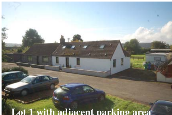
Lot 1 with adjacent parking area

This bright and spacious property was constructed originally circa 1890 but has been substantially extended over the years. In 1985, the northern and western aspects of the property were extended with two new bedrooms, a bathroom, kitchen and conservatory created. Further extensions were carried out in 2005 whereby the whole of what now forms the first floor of the property was created. All five bedrooms are large double rooms. This house offers light and airy accommodation at a very modest price.