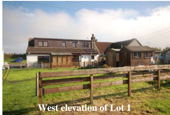
West elevation of Lot 1