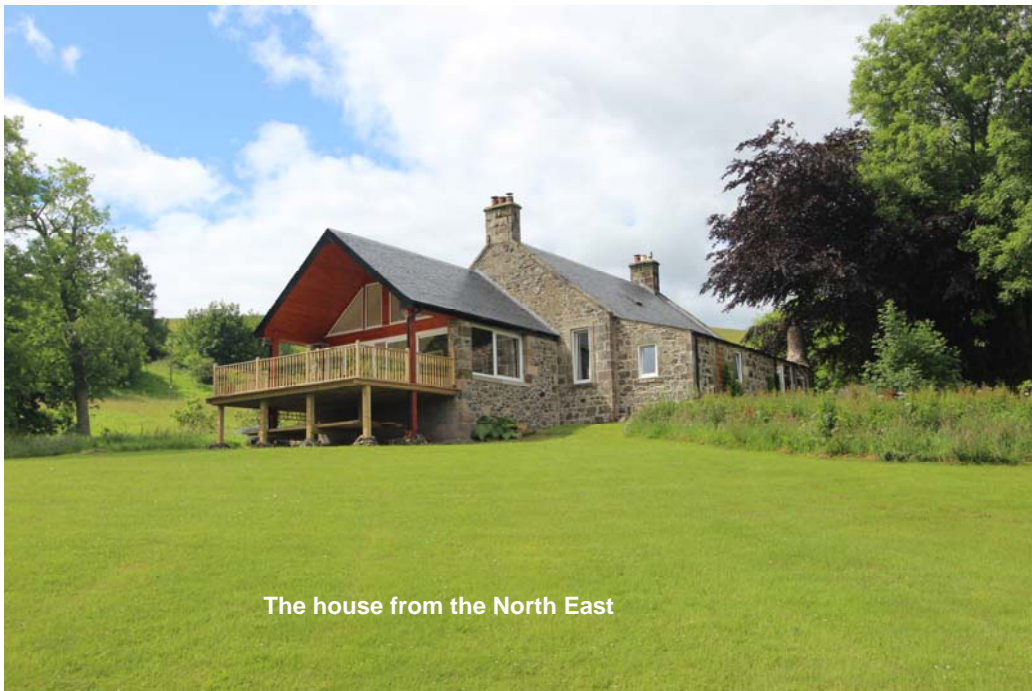
The house from the North East