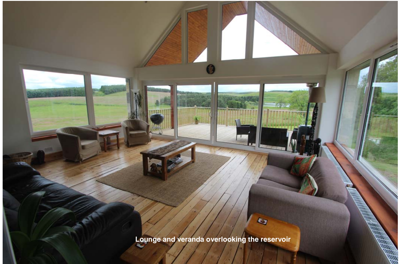
Lounge and veranda overlooking the reservoir

McCrae & McCrae Limited, Chartered Surveyors, 12 Abbey Park Place, Dunfermline, Fife KY12 7PD 01383 722454 9 Charlotte Street, Perth, 01738 634669, 29 York Place, Edinburgh EH1 3HP