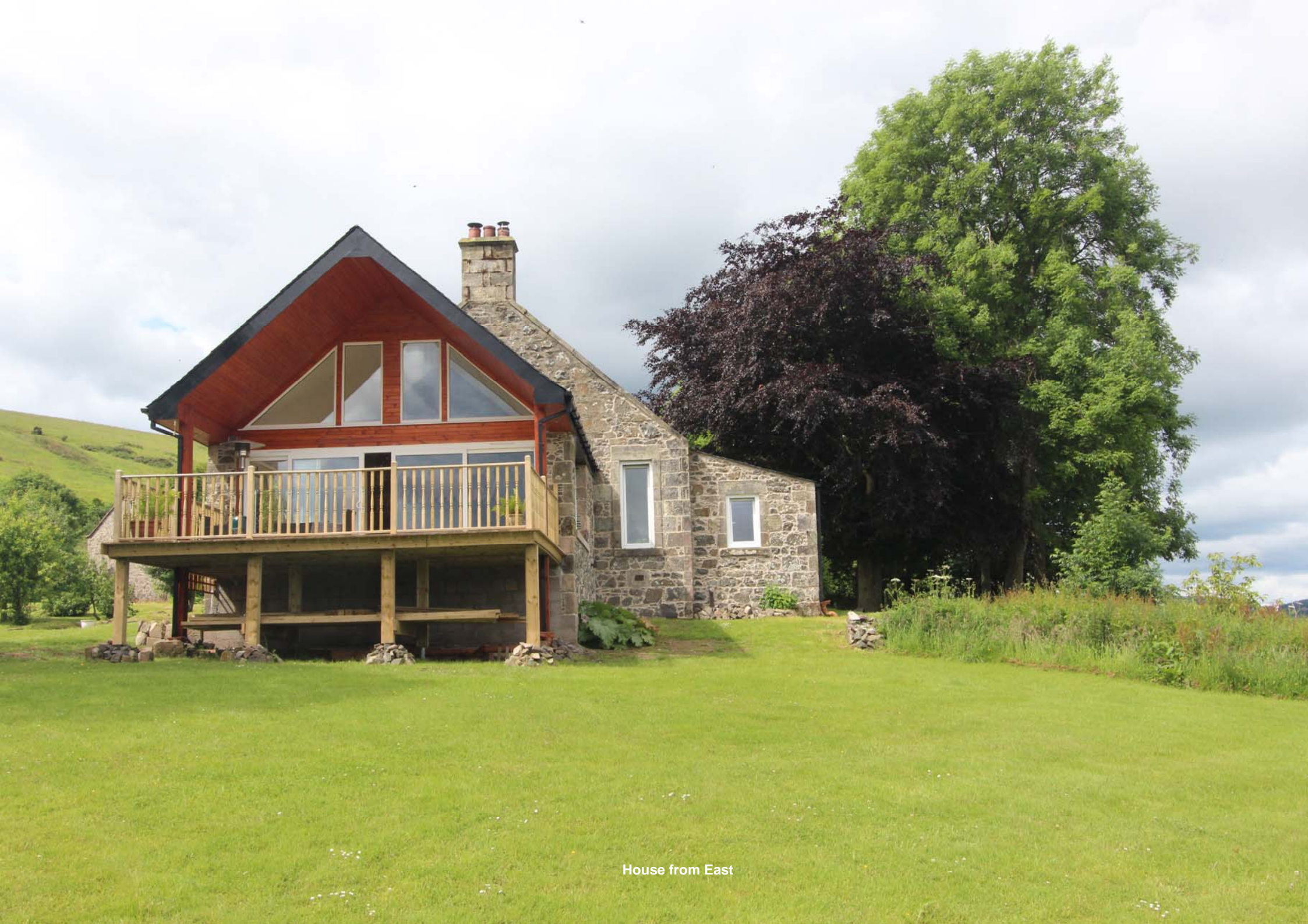
House from East