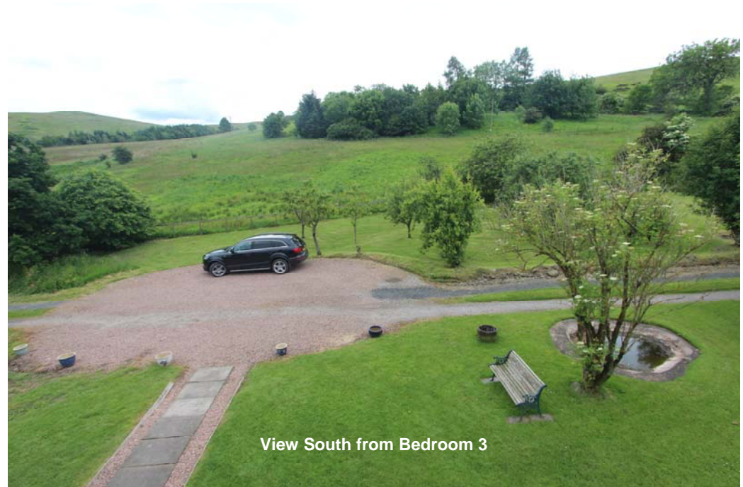
View South from Bedroom 3