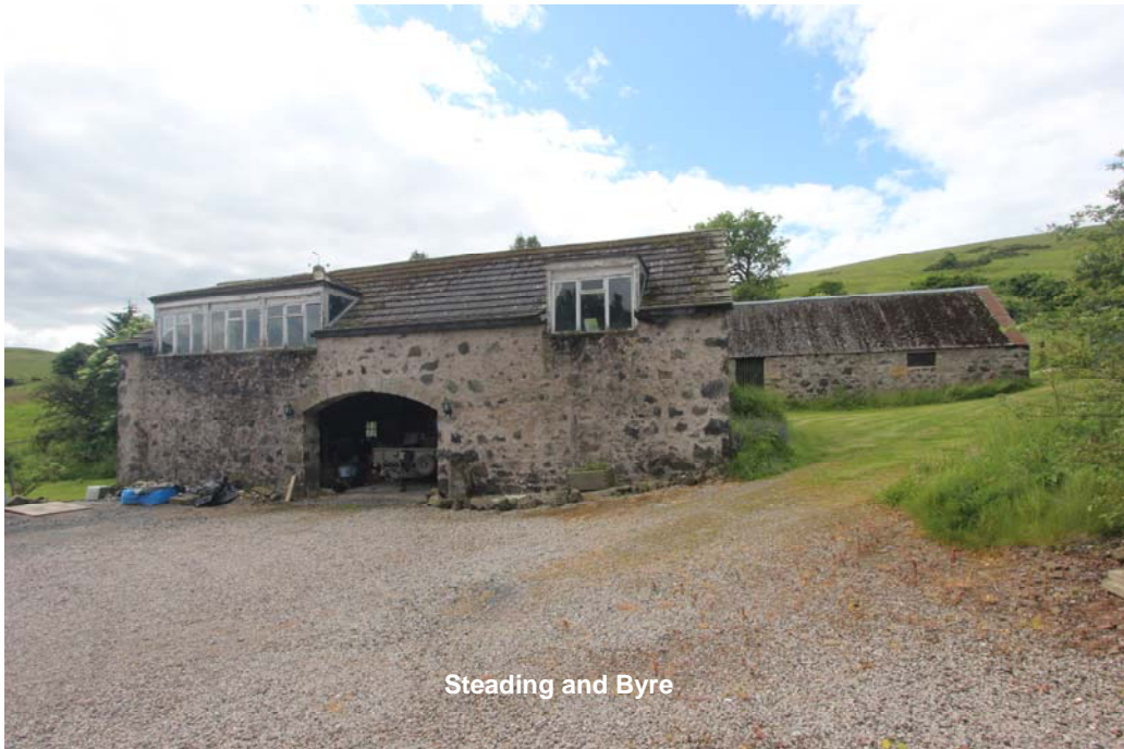
Steading and Byre