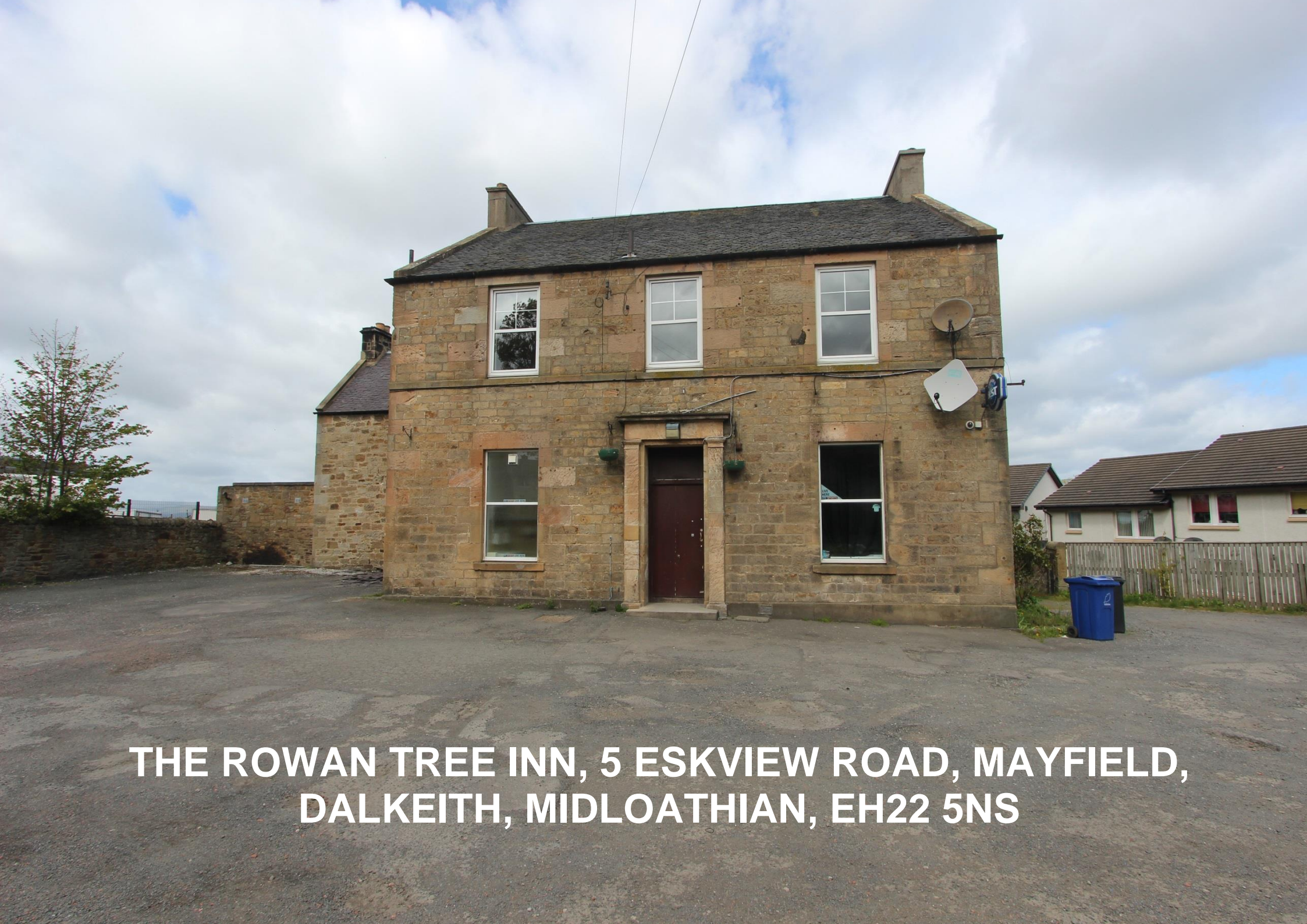
THE ROWAN TREE INN, 5 ESKVIEW ROAD, MAYFIELD, DALKEITH, MIDLOATHIAN, EH22 5NS