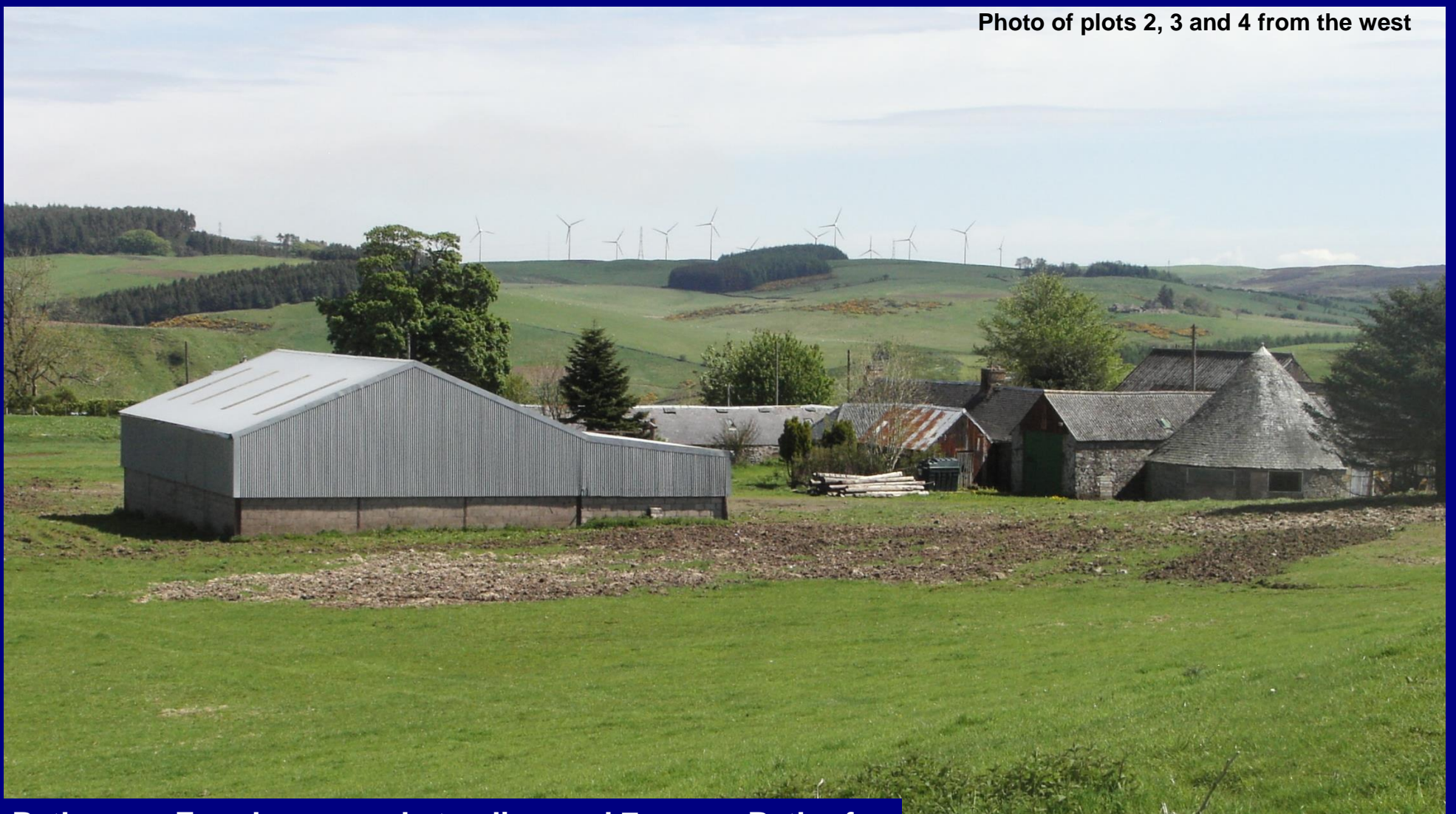
Photo of plots 2, 3 and 4 from the west

Pathgreen Farmhouse and steading and 7 acres, Path of Condie, By Dunning, Perthshire with planning consent for the extension of the farmhouse, two conversion houses and four newbuild houses but the sellers may drop two of the newbuild houses