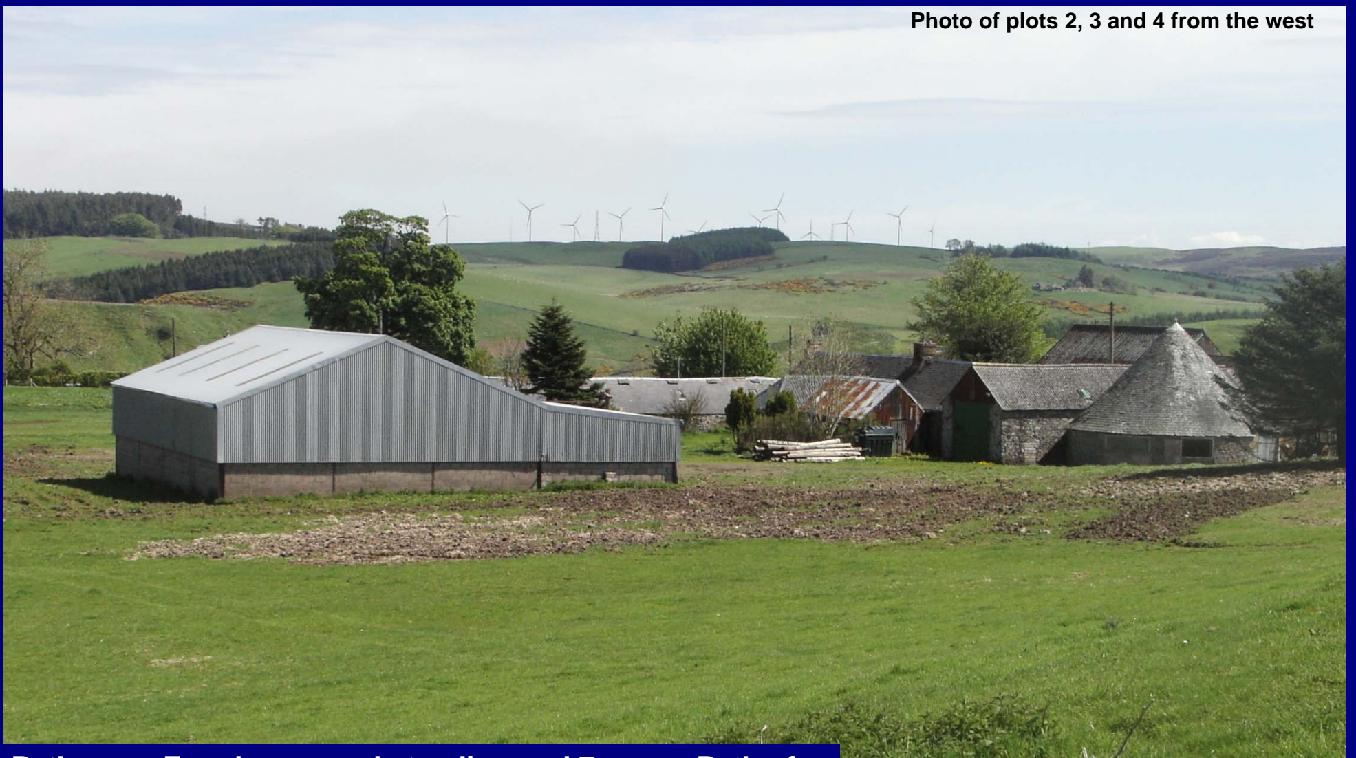
Photo of plots 2, 3 and 4 from the west

Pathgreen Farmhouse and steading and 7 acres, Path of Condie, By Dunning, Perthshire with planning consent for the extension of the farmhouse, two conversion houses and four newbuild houses but the sellers may drop two of the newbuild houses