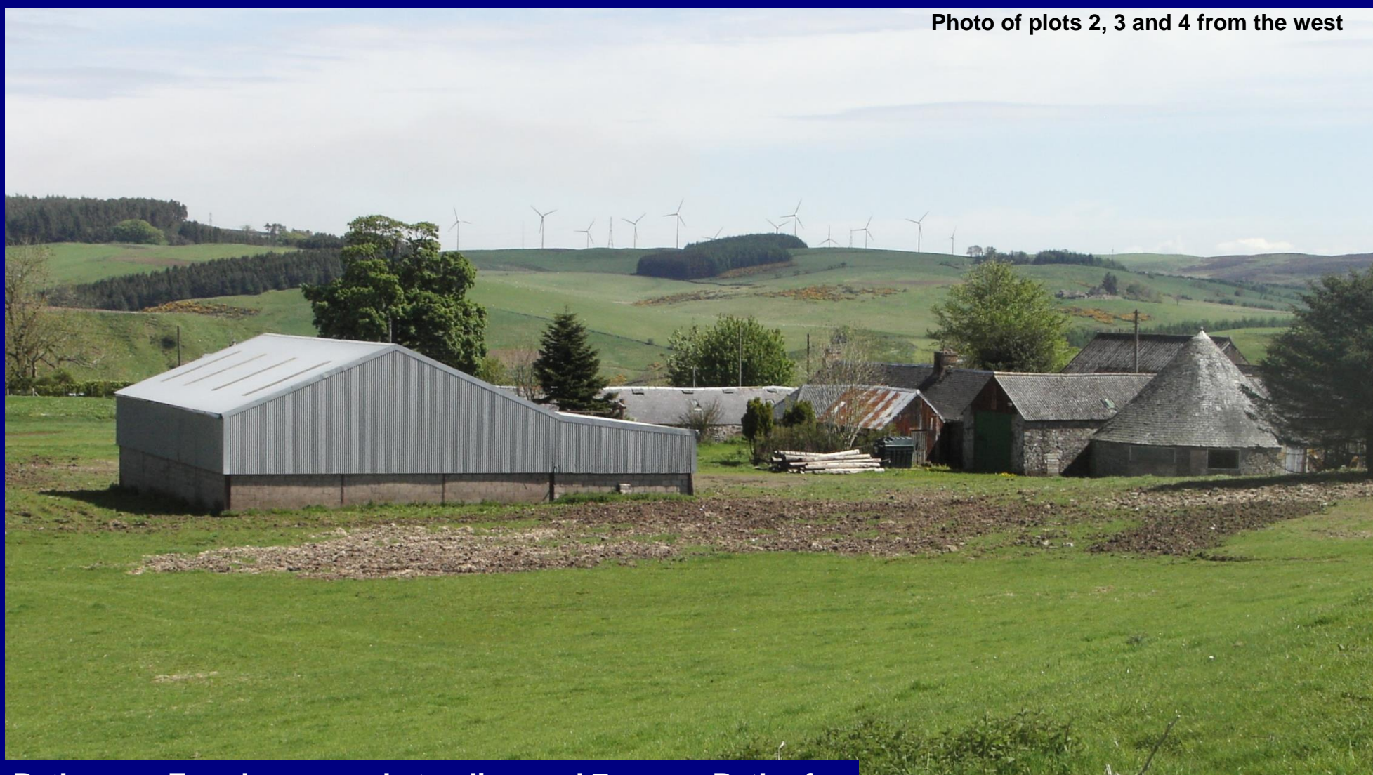
Photo of plots 2, 3 and 4 from the west

Pathgreen Farmhouse and steading and 7 acres, Path of Condie, By Dunning, Perthshire with planning consent for the extension of the farmhouse, two conversion houses and four newbuild houses but the sellers may drop two of the newbuild houses