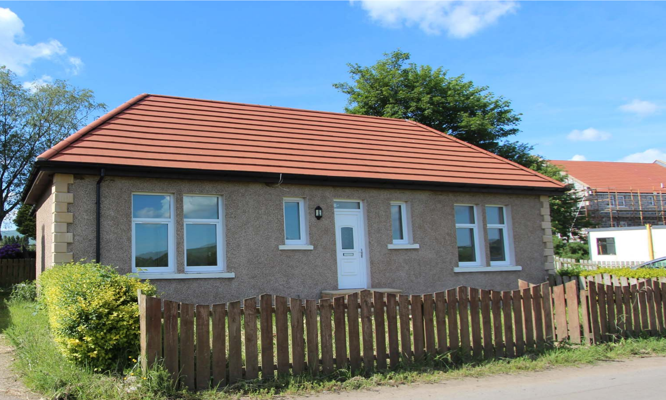
EASTER MUIRHEAD COTTAGE, BY BLAIRINGONE, DOLLAR. FK14 7ND